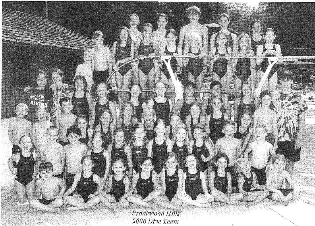
Brookwood Hills 2006 Dive Team

Welcome the Arrival of Fall with your Huntington Road Neighbors