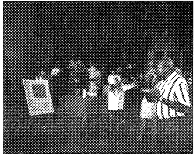
Huntington residents enjoy picnic supper

Residents brought fried chicken, a side dish, a dessert