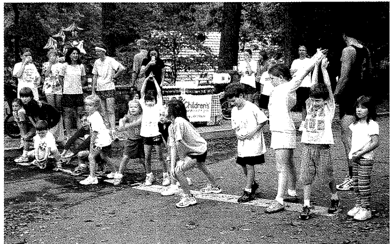
Getting Ready for the Kids Race

THANKS TO THOSE OF YOU WHO ORDERED POINSETTIAS, THEY WILL BE DELIVERED IN EARLY DEC— PLEASE LOOK FOR SIGNS IN THE NEIGHBORHOOD WITH PICK-UP INFO!!