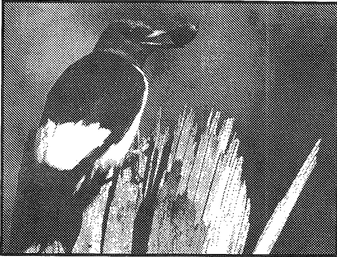
A Red-headed Woodpecker holding an acorn

One of the perils of being married to the editor of Brookwood Notes is that you may be asked to contribute to its production. Having successfully dodged the bullet for several months, I was presented with an ultimatum, write an article or else. The choice was easy and I am glad to share with all of you one of my great passions: birds. First a little bit of trivia related to birds. How many species of birds exist in the world and in North America? You will be amazed that there are in excess of 9,700 species of birds in the world. Over 800 of these species nest in North America and 200 of these which can be seen at various time around our wonderful city.