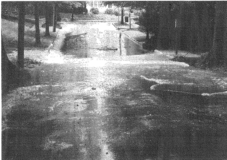
Rainwater streaming down Wakefield Drive during the June 30th storm.