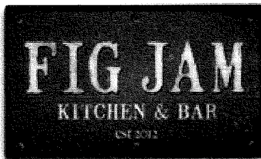
Fig Jam Offer for BWH Residents

In recognition of the importance of our neighborhood to their business, Fig Jam is offering a 15% discount on the total dining bill to every home in the BWH neighborhood.