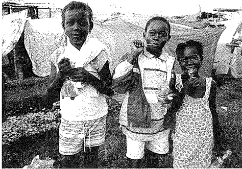
Children from Leogane, brushing their teeth and smiling for the camera in their tent city.