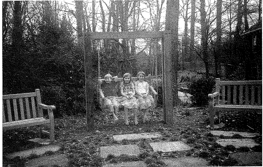
Regan Watson, Hadyn Jolly and Morgan Watson

The Brookwood Hills Garden Club recently installed a beautiful garden on the vacant Huntington Road lot owned by the Brookwood Hills Community Club. The improvements include: 2 teak benches, teak swing, crab orchard stepping stones, Japanese maples, camellia sasanqua, otto luyken, hydrangeas, gardenias, ferns, dwarf mondo, lirioppe and 2 annual beds and an irrigation system. The lot which sat idle and overgrown for years has now been transformed into a lovely respite for all to enjoy. Stop by on your walks around the neighborhood or on your way up Huntington to enjoy shopping or dinner at our area merchants.